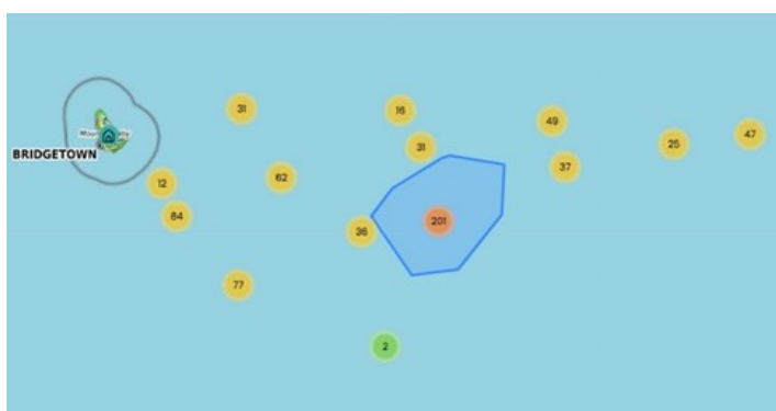
Figure 2. Visualisation of the cluster analysis indicating areas of potential fishing activity .

The 6 VMS have been effectively gathering experimental data. During this reporting period, there were 9 completed trips, and a total of 54 days' worth of data was collected. The distance travelled per boat ranged from 1500 - 4000km and the trip time per boat ranged from 300-790km. The furthest range recorded was 481.1km. Figure 1 shows the distribution, range and areas of possible fishing activities of the longline vessels logged from 07 July, 2023 to August 23, 2023. Analyzing patterns in vessel speed over specific spatial and temporal intervals can reveal potential fishing behaviours. The VMS have effectively captured patterns of speed reduction, halting, and subsequent resumption of movement. A cluster analysis was also conducted which shows the densities of geolocation points associated with fishing activity (Figure 2). These clusters offer insights into specific regions or fishing grounds commonly frequented by longline vessels during their operations. It is anticipated that 4 additional devices will be installed aboard longline vessels before year end.