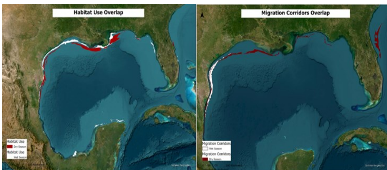
Figure 2. Overlap of tiger, blue, scalloped hammerhead and great hammerhead sharks during habitat use and migra-

KEYWORDS: Satellite Telemetry, monitoring, habitat, corridors, sharks