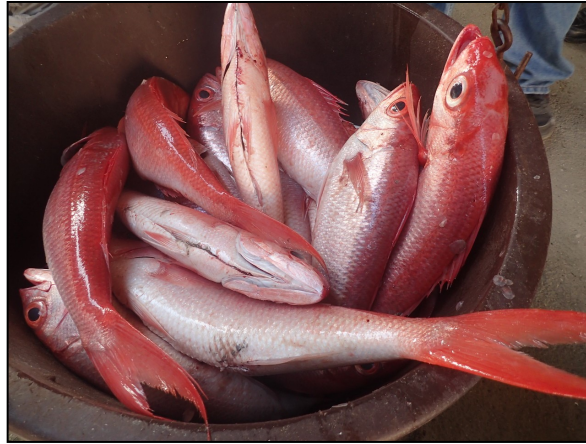
Figure 2. Queen snapper Etelis oculatus at a fish market in Puerto Cortes, Honduras.