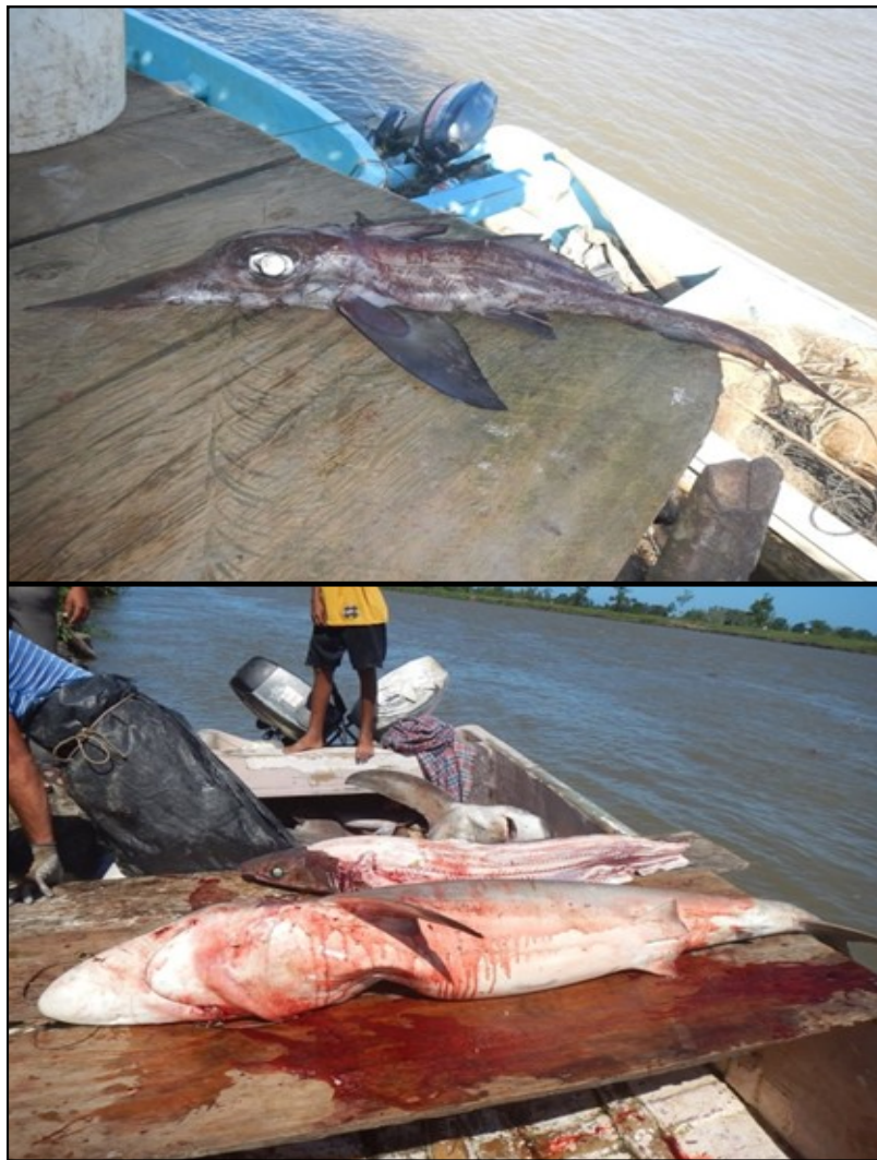
Figure 1. A rare chimaera (top) and a night shark Carcharhinus signatus and gulper shark Centrophorus sp. (bottom) ready to be processed in Quetzalito, Guatemala.

It is clear that deep-sea fisheries are expanding in the region, with demand increasing both from the hospitality and tourism sector for high quality fish, and in demand for protein among the region’s expanding population. Coastal fisheries are in decline in many part of the MAR, and deep-sea fishing is a likely alternative for coastal fishers in these countries. Very little is known about the species diversity, abundance, and life history of the fishes that are being landed in the deep-sea of the MAR; therefore, more research is needed for sustainable management of these fisheries.