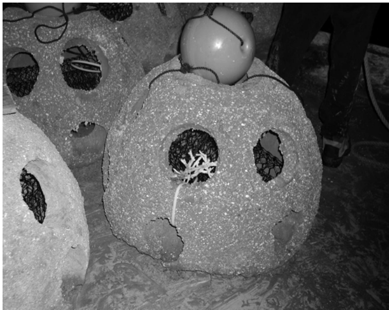
Figure 2. Reefballs with attached coral transplants and additional internal complexity created by vexar mesh. Floats help slow descent rate and can be used to locate reefballs for surveys

The first large scale restoration effort was initiated in 2000 when experimental coral transplant structures were deployed in Sebastian Pinnacles, a badly degraded region of the EORR. Two types of restoration units were utilized: reefballs and reefdisks. Reefballs were perforated hemispherical concrete structures ( www.reefball.org ) approximately 1 m in diameter, 0.7 m high and weighing 180 kg (Figure 2). Reefballs were chosen to simulate O. varicosa colonies and provide fish with benthic structure similar to natural coral heads. A small colony of live coral was attached to each reefball with the anticipation that the coral fragments would eventually overgrow the structure and form the foundation for coral recolonization. Corals were attached to the reef balls with cable ties and a quick-setting cement mixture approximately five minutes prior to deployment and were covered with seawater-saturated paper towels to avoid dehydration on deck. The reefballs were deployed in an experimental design to investigate the effect of cluster size and internal complexity on association of fish populations.