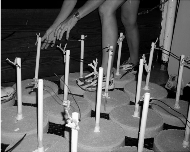
Figure 3. Reefdisks with 'large' coral fragments attached and ready for deployment

Coral fragments were collected on scuba by members of the Association of Underwater Explorers (AUE divers) from an unidentified wreck at 90 m and from the 'Cites Service Empire' wreck at 64 m. Corals were maintained in chilled re-circulating aquaria until needed.