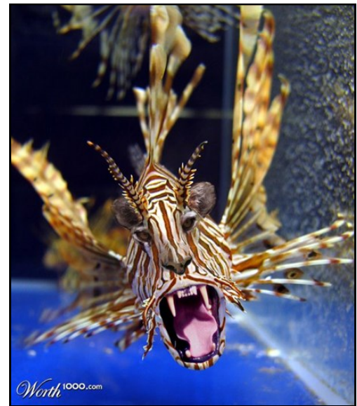
Figure 1. Depiction of a supernatural lionfish.

Lionfish are a fish, and like any other teleost fish, are bound by intrinsic biological rates. Lionfish are likely to grow at similar rates, consume similar amounts of diet, feed in similar ways as other akin scorpaenid fishes either in their native range or in the Atlantic. We can expect the biological rates of lionfish, like any other invasive species, to reflect the opportunity of open niches and density independence. These temporary unrestricted rates should not be confused with abnormally high biological rates, but yet a reflection of the environmental conditions which will eventually be controlled by density dependence. Undoubtedly, the uniqueness of lionfish among Atlantic scorpaenids makes them stand out. Their behaviour, body morphology, and higher densities are much different than any native scorpaenids. This different, however, is merely a reflection of biology that existed before the lionfish introduction. It is the geography, niche space, and density independence that has changed, not the animal.