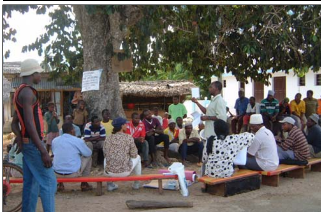
Figure 2. Generating management priorities from stakeholder meetings in Zanzibar.

In Puerto Rico, due to the small size of the fishery (approximately 40 full-time commercial fishers), the training workshop also served as an outreach meeting to inform key stakeholders from the fishing community and management agency staff about the ParFish assessment. Key stakeholders were then tasked to provide feedback from the meeting to all relevant fishers. It was found however, the fishery is conducted from two main areas of the island, and the fishers involved in the training workshop all came from the same area. As a result, fishers from the other area were not included in the training workshop and did not receive information about the assessment prior to interviews taking place. This caused significant delays in the data collection stage and reduced the likelihood of fishers participating.