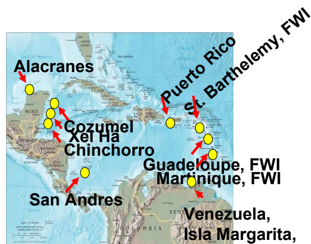
Figure 1. Samples for histological study of Strombus gigas in different localities from the Caribbean region.

The dominant stage at any moment are generally the gametocysts, but their importance seem to vary with the time of the year, presenting different patterns at every locality, which may be influenced by the prevailing environ-