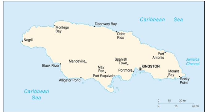
Figure 1. Map of Jamaica showing the location of the Negril Marine Park .

The Negril Coral Reef Preservation Society (NCRPS) is currently accommodated at the Negril Marine Park Headquarters in the rural town of Negril in the parish of Westmoreland. Since its inception in 1990, NCRPS in collaboration with the Negril Area Environmental Protection Trust (NEPT) and the Negril Chamber of Commerce, played a key role in the establishment of the Negril Marine Park until official declaration of the Park on 4th March 1998 (NRCA 2002). The The Negril Marine Park (NMP) is located at the western end of the island of Jamaica (Figure 1) and the area of the NMP is approximately 160 km 2 . The NMP extends from Davis cove in the North to St. Johns Point in the south (Figure 2).